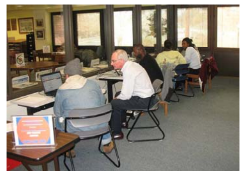
Job Search Center at the Main Library

The Library served 3,419 people seeking job search-related services this past year. The Job Search Center began in 2009 with a grant from the Lower Shore Workforce Alliance, the workforce division of the Tri-County council for the Lower Eastern Shore of Maryland, to fill a need the reference librarians were seeing on a daily basis: people needing assistance and extra time on the public access computers to fill out job applications and complete resumes. In today's job market, you must fill out an online application and have a resume for nearly every job. The Job Search Center provides designated computers and staff just for those needs.