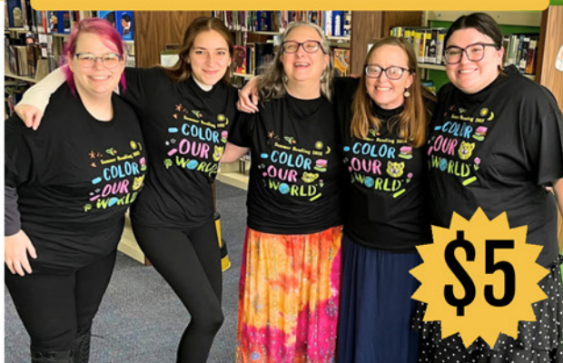
Sarbanes Children's Librarians are ready to color your world!

Introducing this year's Summer Reading T-shirt! You can pick up your shirt for $5 at any Wicomico Library Branch. Grab yours today and let the adventure begin!